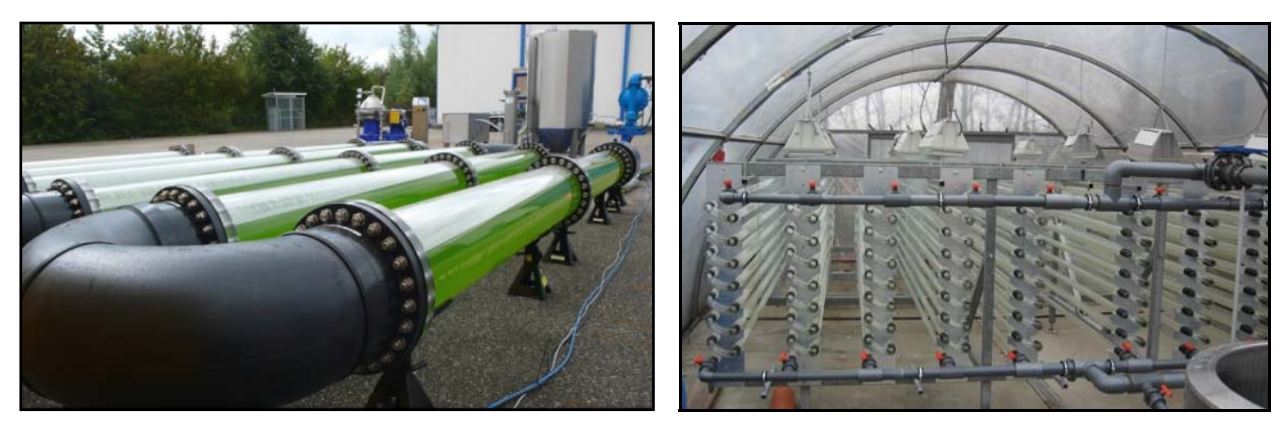
Figure 2. Tubular photobioreactors in outdoor (left) and enclosed (right) environments.

One of the byproducts of the biofuels production from algae is a protein rich algae cake that can be used as animal feed. Photobioreactors make it possible to supply biomass without impacting the cost of agricultural land, competing with food production and harming the environment.