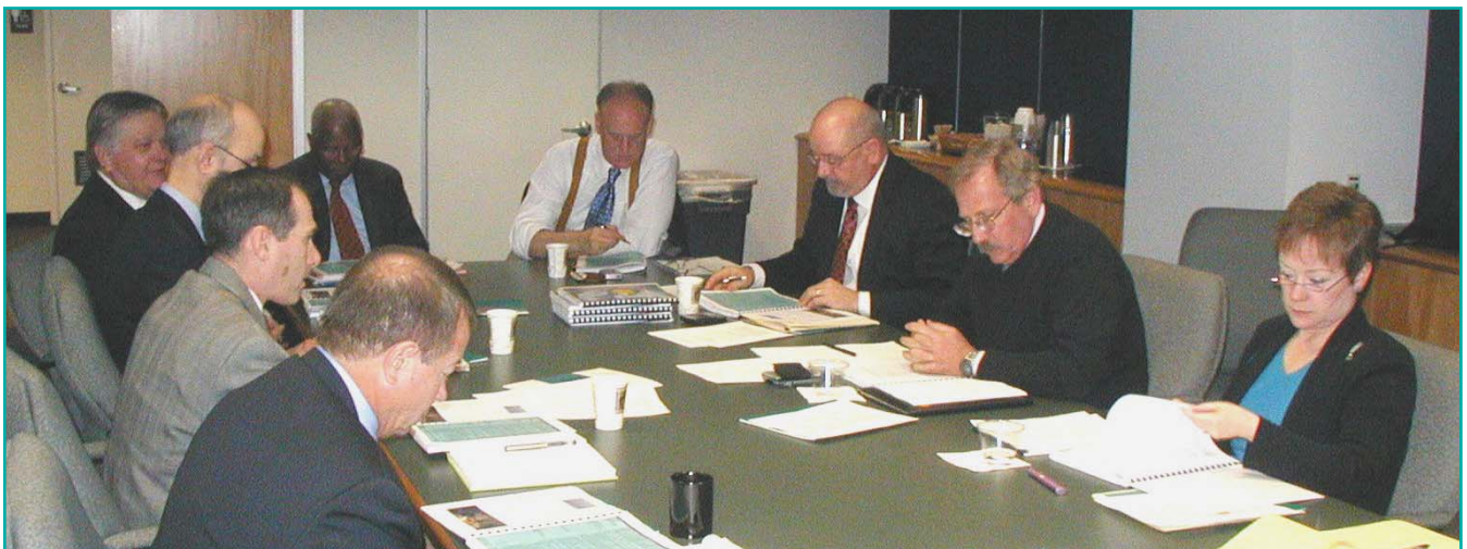
Executive Steering Committee members discussing the progress and future direction of the EERE/NASULGC partnership at the January 25, 2005 meeting.

For NASULGC, the benefits of collaborating with EERE include helping its member universities increase their responsiveness and relevance to the practical, current problems of society, and to provide opportunities for faculty and students to gain access to research and new knowledge. In addition, new opportunities for the university Extension programs were explored and discussed by representatives from NASULGC with a Task Force that had been assembled by EERE to examine the deployment of energy efficiency and renewable energy technologies.