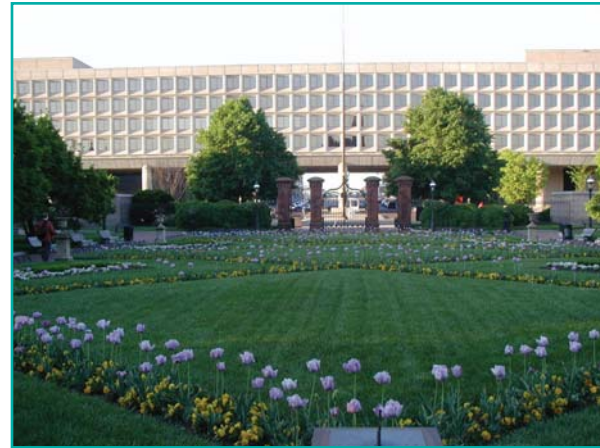
The overall EERE portfolio provides a combination of multiple renewable energy technologies — solar, wind, biomass, geothermal, and others — together with research and development of energy efficiency technologies. Shown: Department of Energy Headquarters (the Forrestal Building) in Washington, D.C.

They proposed a partnership between EERE and NASULGC that would expand the working relationship between member institutions of NASULGC and DOE. This would create an opportunity for EERE to more cost-effectively carry out its mission to develop and disseminate