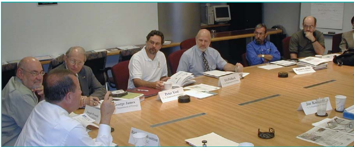
DOE scientists and university Extension officials met together in workshops on energy-efficient housing to disseminate the DOE Building America “Best Practices Guide” to building contractors. (Project 2-A)

Overall management for the pilot year partnership has been provided by a 10-person Executive Steering Committee, consisting of key executives from EERE and NASULGC. Leadership for each of the projects has been provided by a Project Leadership Team consisting of senior-level managers from both organizations. Nine EERE personnel and one staff member from the National Renewable Energy Laboratory (NREL), as well as 10 NASULGC personnel, consisting of representatives from NASULGC, the Agricultural Experiment Station, and/or Extension Directors Regional Associations, have served on project leadership teams.