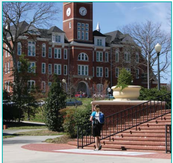
A voluntary association of public universities, land-grant institutions, and many of the nation's public university systems, NASULGC campuses are located in all 50 states, U.S. territories, and the District of Columbia.

energy efficiency and renewable energy production technologies. It would also serve to enhance the research and education capacity of NASULGC institutions by allowing them to interact more closely with EERE's energy research and development programs and National Laboratories.